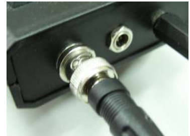
BNC Input for Accelerometer