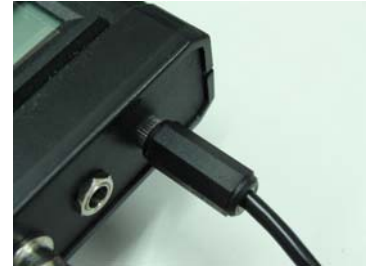
Audio Output for Headphones