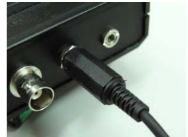
Battery Charging Jack.